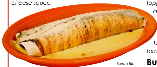
Burrito Rio Grande

A 12" burrito stuffed with steak, beans and rice, topped with special Mexican sauce and cheese sauce.