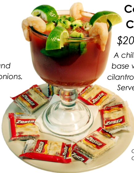
Cocktail de Camaron

A chilled tomato soup base with shrimp, onion, cilantro and avocado. Served with crackers.