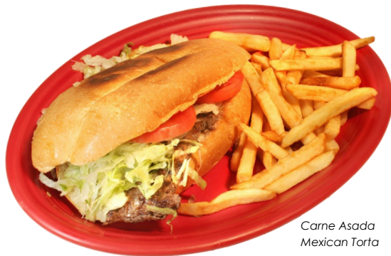
Carne Asada Mexican Torta

Carne Asada (Steak) Grilled Chicken, Pork or Milanese (thin sliced beef or chicken, breaded and fried)