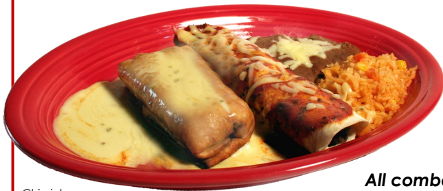
Chimichanga and Burrito

Pick two items from the list with your choice of filling.