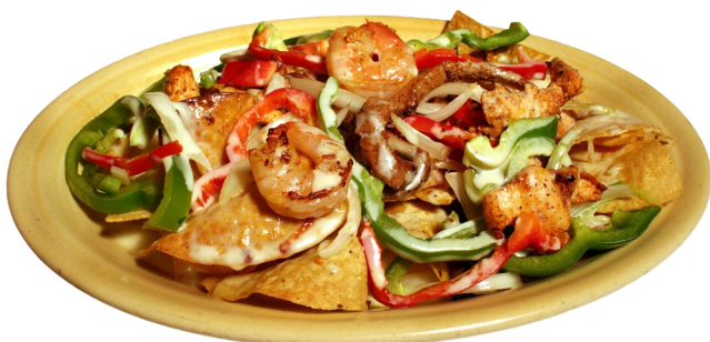
Nachos Fajita Mix

Steak or grilled chicken with bell peppers and onions. Choose shrimp for $1.00 more.