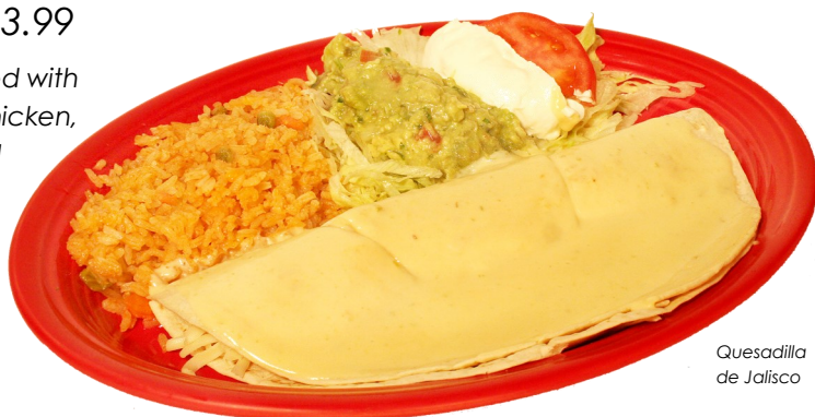
Quesadilla de Jalisco

A flour tortilla grilled and stuffed with cheese, steak, ham and pineapple. Served with lettuce, sour cream and tomato.