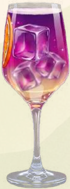
Limoncello Spritz $190.00