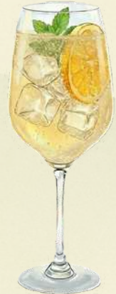
Hugo Spritz $210.00