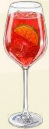
Campari Spritz $190.00