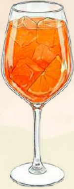
Aperol Spritz $190.00