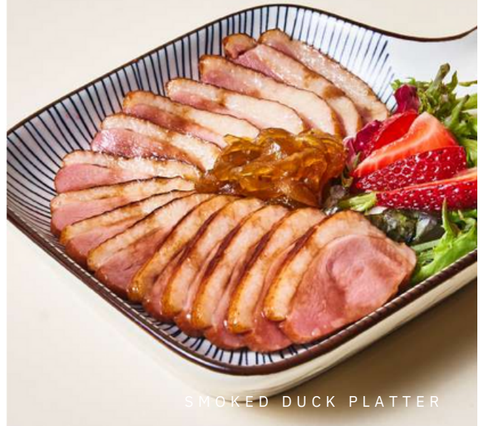
SMOKED DUCK PLATTER