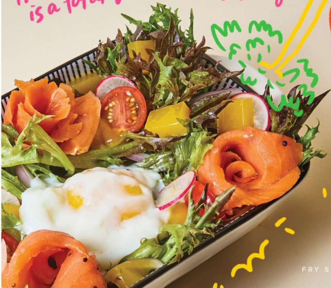
FRY SIGNATURE SALAD

"This homemade tangy yuzu jelly is a total game changer!" - Wendy