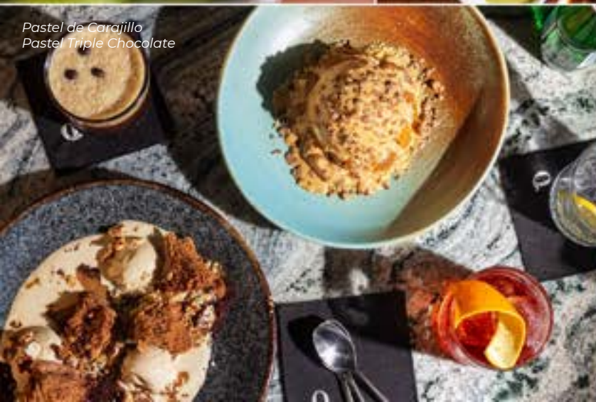
Pastel de Carajillo Pastel Triple Chocolate